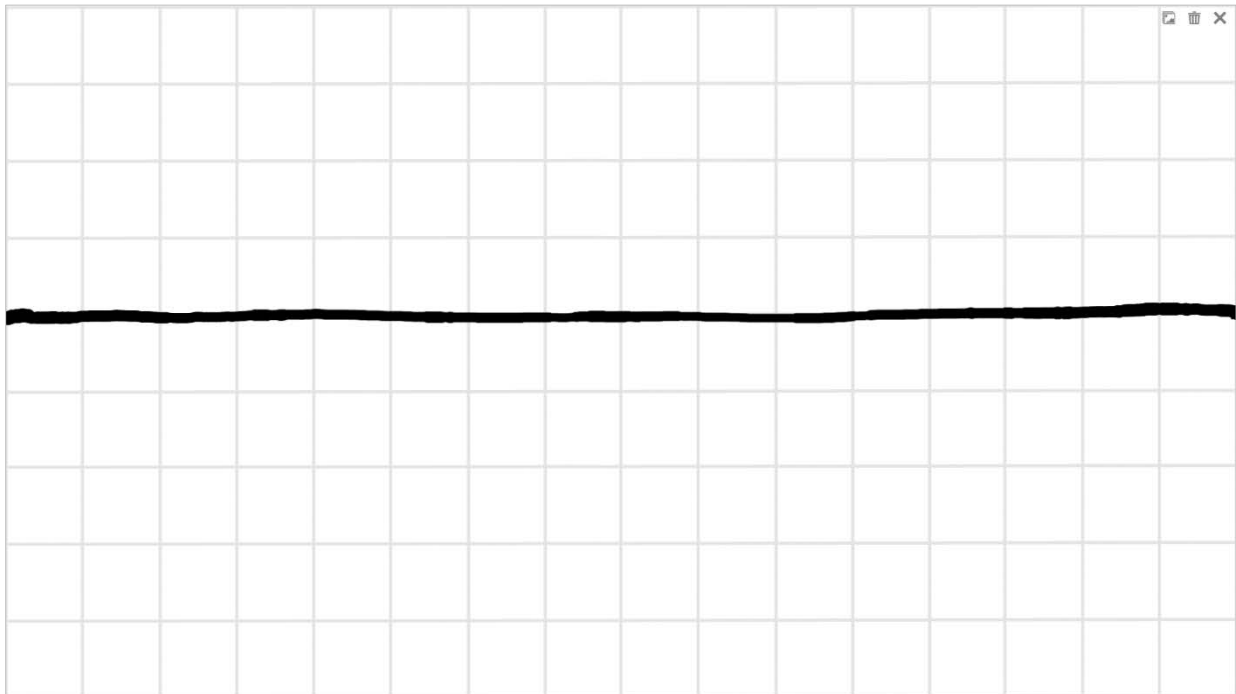
Figure 2: Horizontal Test

The reason for using a stylus as opposed to a finger to perform the test is because ShadowSense applies motion filters to all touch points except when a stylus is detected. Small movements in touch (jitter) are undesirable while small movements in a stylus are tracked for more accurate writing.